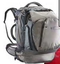
'Bug-Out' Backpack & Car Kit