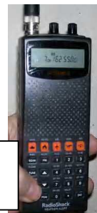
Battery Operated Weather Radio

2. A battery-operated weather radio should also be included, preferably one that supports the S.A.M.E. alert or a tone alarm.