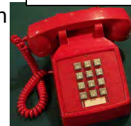
Land Line Phone-with Cord to Handset

1. Land-line telephone. This is the phone that you just plug in to your house phone jack. It is powered by amplifiers in the phone system, so it may work even if your power is out. Cordless phones or ones that are plugged into an electrical outlet do not work if the power is out.