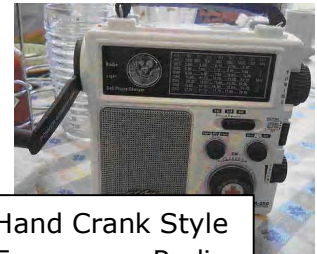
Hand Crank Style Emergency Radio

1. A good windup, solar, or battery-operated radio should be in every household. AM/FM is fine, although some people may appreciate having additional shortwave bands. If needed, store extra batteries.